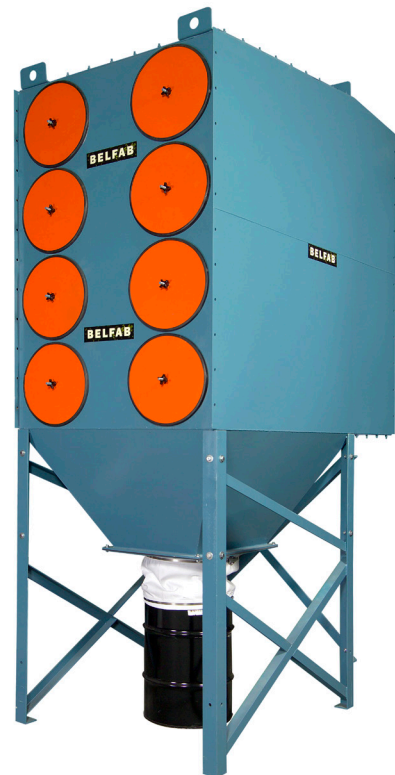
BELFAB MPJC H8 DUST COLLECTOR