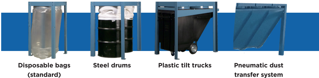
Disposable bags (standard)