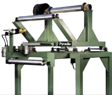
Single position lightweight unwind with automatic edge guide system and tension control can handle 500 lbs rolls.

This phantom axis turret winder is equipped with pull roll section, score edge trim, offset pivot guide and triple lay-on roll mode of operation. It can operate with the lay-on roll, disengaged, pressure controlled or in minimum gap mode. The latest technology is used to control the winder, through AC Vector drives, PLC and user friendly MMI. The toughest materials can be cut on the fly using our revolutionary back-knife support system (patent pending).