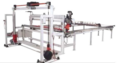
Light roll-floor pickup unwind stand with integral sheeting station.