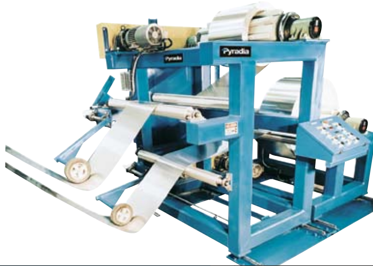
Dual position uncoiler, specially designed for the foil industry, can handle 10 000 lbs rolls and is equipped with a manual splice table

All of our models, from the simplest single position stand to the most sophisticated automatic turret can incorporate the following features and options: