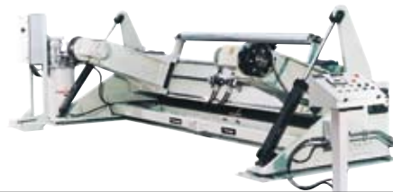
Single position lightweight unwind with automatic edge guide system and tension control can handle 500 lbs rolls.