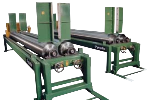
Driven surface unwinds with side paddle roll containment.