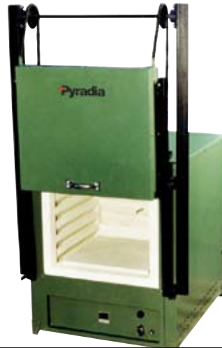
Enamel coated steel casing, with optional vertical opening door